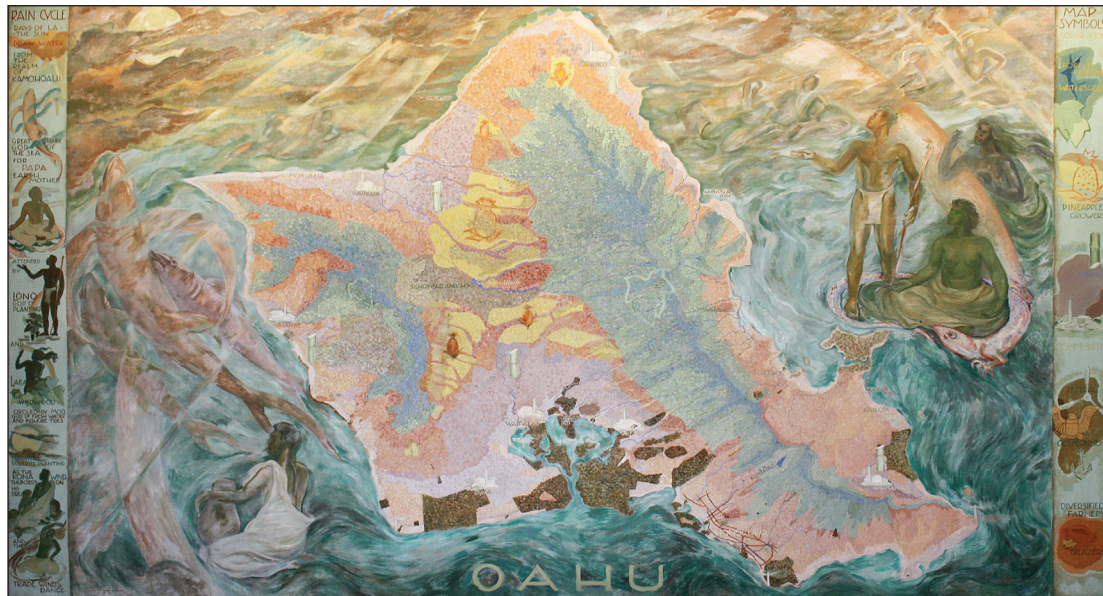
Found on the covers of the Water Master Plan and Summary, this mural is just inside the entrance to our Engineering building.

A quick-read overview highlighting the need, process, and outcomes of the WMP.