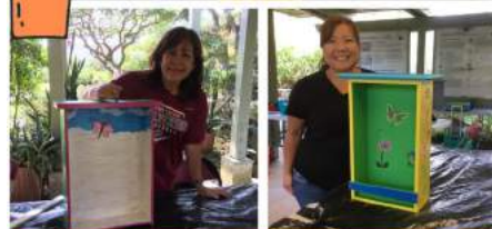
Creative & fun!