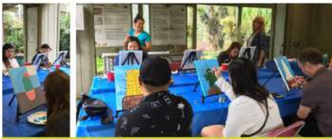
Creating Cactus Art Workshop at Halawa Xeriscape Garden