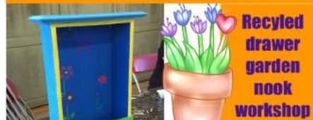
Recycled drawer garden nook workshop