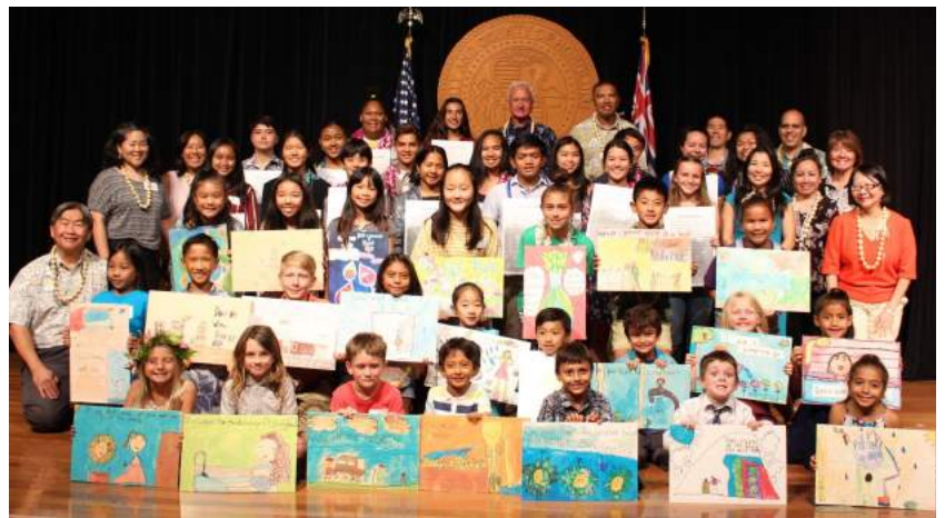
Photo: This year's winners.

FOHXG is a proud sponsor of the Water Conservation calendar and the Poster and Poetry Awards Ceremony. Calendars will be available to the public in December while supplies last.