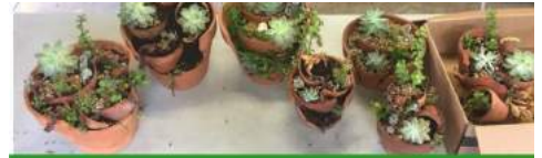
Terracotta Madness Workshop at Halawa Xeriscape Garden